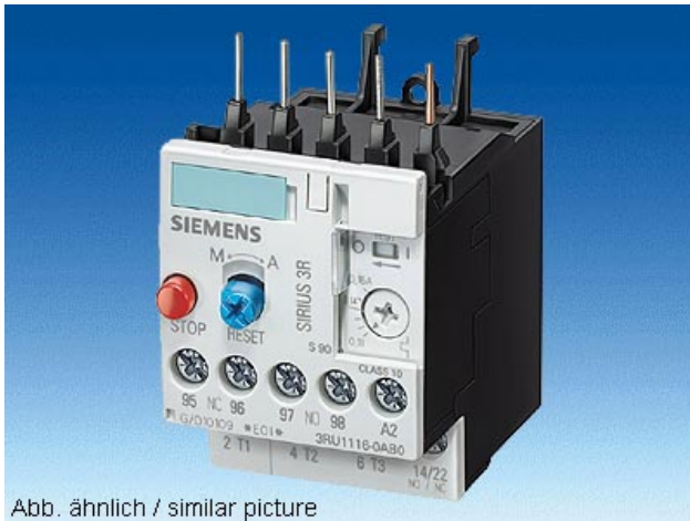
Abb. ähnlich / similar picture

OVERLOAD RELAY, 9...12 A, 1NO+1NC, SIZE S00, CLASS 10, FOR CONTACTOR MOUNTING